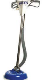
Hydroforce SX Series

Upgrade your TCS truckmount system to 2000 PSI for hard surface cleaning. Package upgrade includes XP Little Giant heater and Emperor 1813 pump to maintain high heat and maximum pressure.